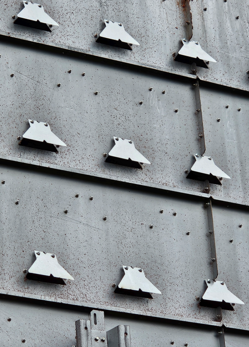
Duct covers open while dryer running